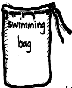
for wet shoes & clothes